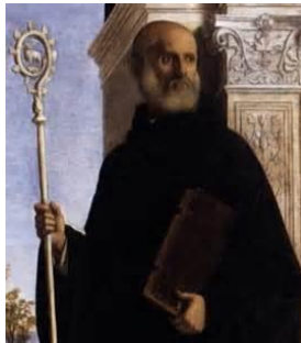
S. Benedict's, Chapel Hill, NC