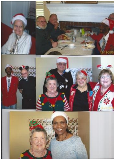
Christmas Party sponsored by Saint Hilda's Guild.