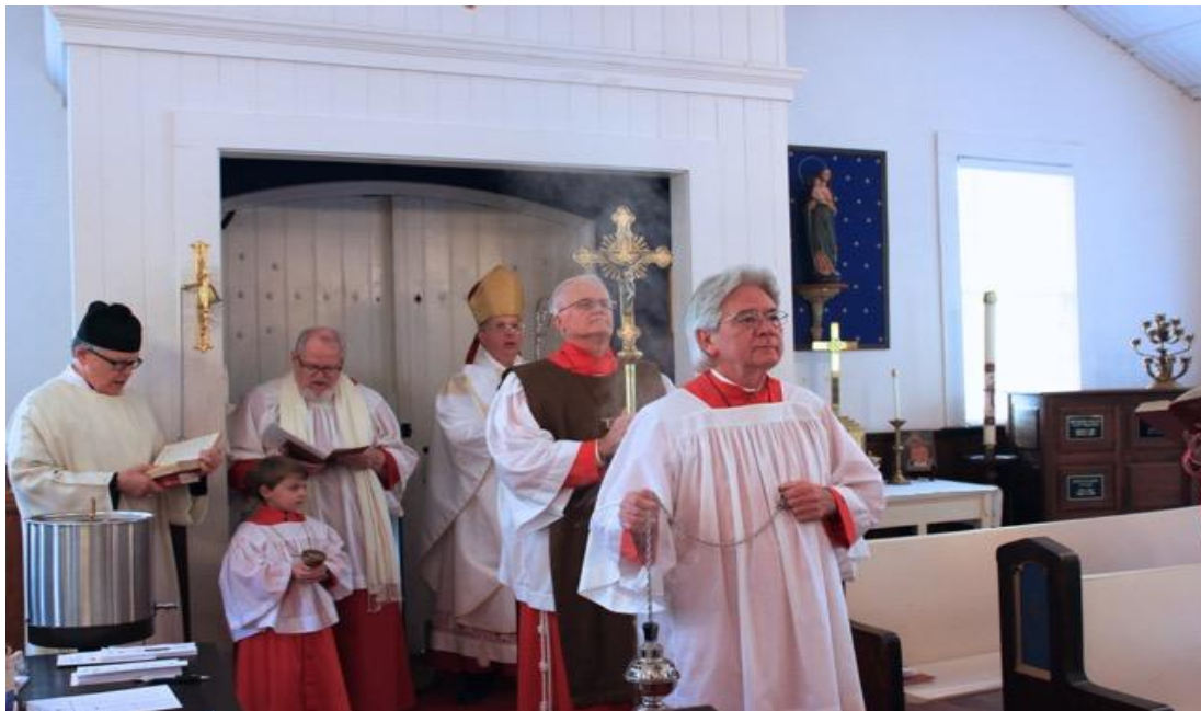
The Archbishop's visit on 15 November.