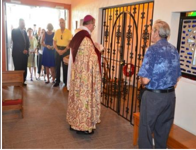
Dedicating our columbarium.