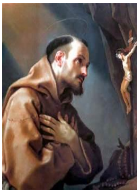
S. Francis of Assisi, Gainesville, GA