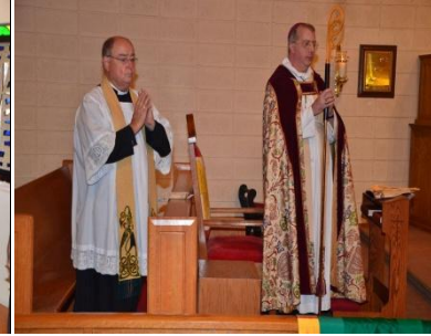
The Abp. & Adcn. at prayer.