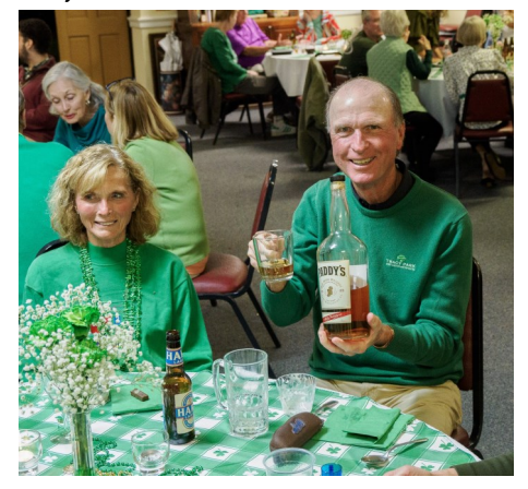
ditional corned beef and cabbage, accompanied by Irish beer.

Not to be overlooked was St. Patrick's Day, which we did celebrate with tra-